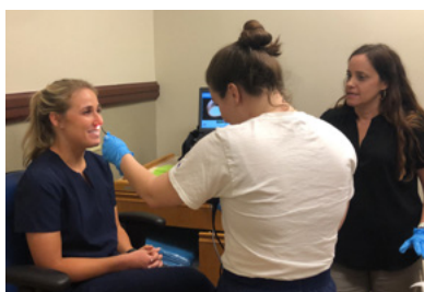
A look into the Fees Labs