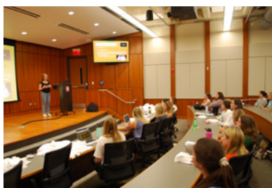
NSSHLA; About NSSHLA and the new President