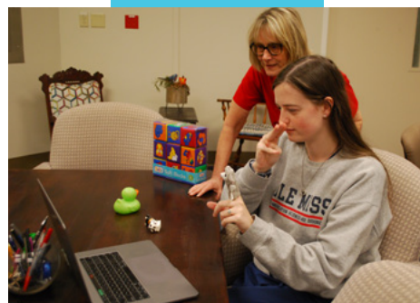
Students conduct teletherapy sessions with clients over Zoom.