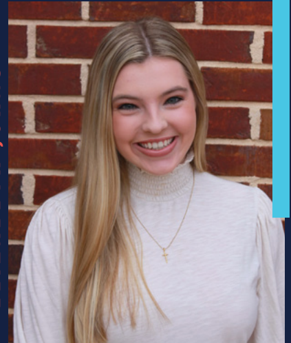
Communication Sciences and Disorders '24