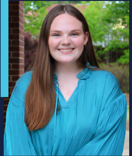
Communication Sciences and Disorders '24