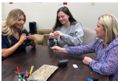
Spring Labs offered for graduate clinicians