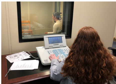
Students doing hearing tests in the Audiology Clinic.

The CSD program offers a variety of labs and clinical opportunities for graduate clinicians to have hands-on learning.