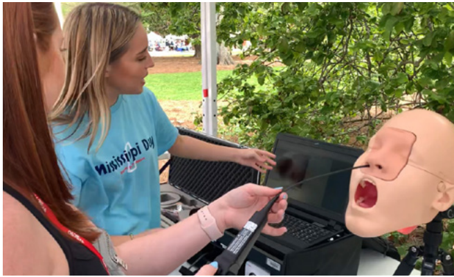
CSD student shows a prospective student how to use a FEES machine