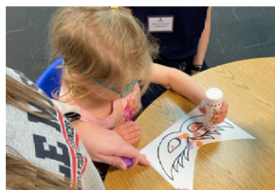
PLG Program; About the program and events